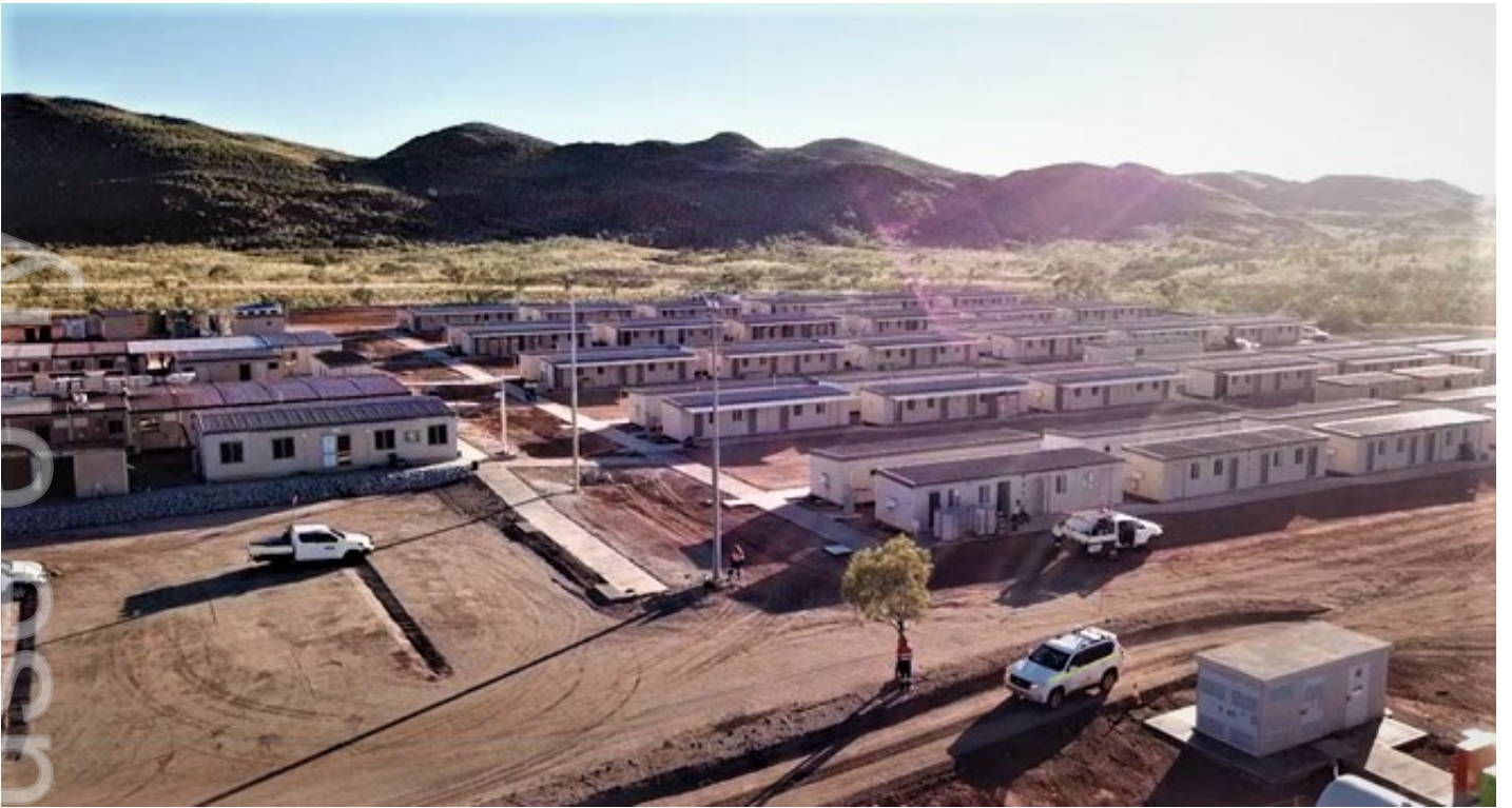
Figure 1: 240 room village at Warrawoona