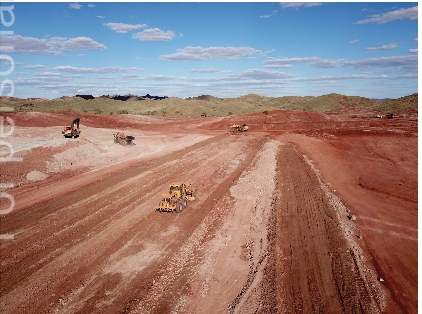
Figure 2: Bulk earthworks at process plant well underway